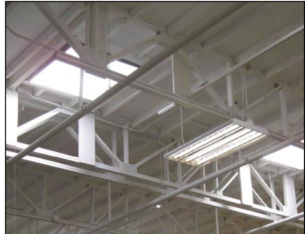
FIGURE 2-2 – CLOSER VIEW OF LIGHTING AND SKYLIGHTS

On-site verification and monitoring of the loads verified the daylighting controls of the lighting worked. The power for several lighting breakers was monitored. PetSmart disabled the controls for a week so baseline lighting load energy use profiles could be collected. The baseline period used in the following analysis was from 8/22/08 to 8/28/08. The daylighting control period used in the analysis was from 9/4/08 to 9/10/08.