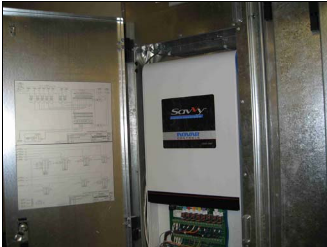
FIGURE 2-3 – ENERGY MANAGEMENT SYSTEM