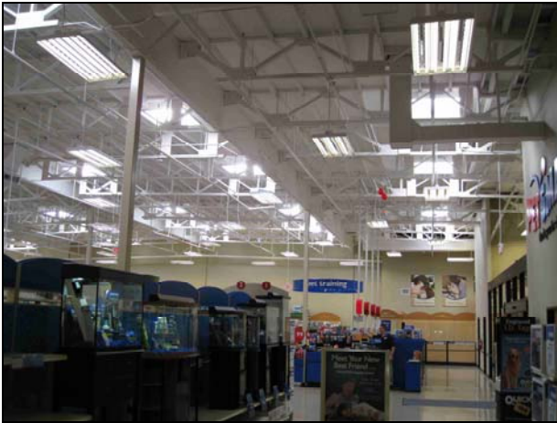
FIGURE 2-1 – LIGHTING TOWARDS THE FRONT OF THE STORE

The test building for this project was a new construction site for PetSmart, located at 3900 Sisk Road, Modesto, CA, which was opened to the public in July of 2008. Typical store hours are Monday-Saturday 9am-9pm and Sunday 10am-6pm. The building is a one-story retail store with approximately 23,500 square feet. The sales area has 42, 4'x4' skylights. There are 25 interior perimeter suspended seven-lamp fixtures and 52 six-lamp fixtures in the main sales area. The four-foot fluorescent lamps are 32 Watts and the dimming ballasts are electronic (Advance Mark 7, 0-10V, continuous dimming ballasts). The lighting fixtures are on 277 Volt circuits. PetSmart encountered some issues integrating the dimming ballasts into their energy management system (EMS), a Novar Savvy system, but the problems were resolved. Figures 1-1 and 1-2 show samples of the lighting system.