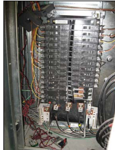
FIGURE 2-4 – LIGHTING PANEL HA WITH MONITORING EQUIPMENT

Lighting levels were measured with a hand held light meter. These measurements were taken at nine different locations in the sales area during mid morning and repeated for the three conditions reported in Table 1. The measurements were made at 4 feet above the floor. There were only two measurements that were below 50 foot-candle, which is the minimum level recommended by the Illuminating Engineering Society for reading small font. Both were toward the northwest side at the end of aisles. The store manager commented that there are dark spots in the showroom corners.